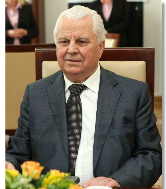
Pres. Leonid Kravchuk