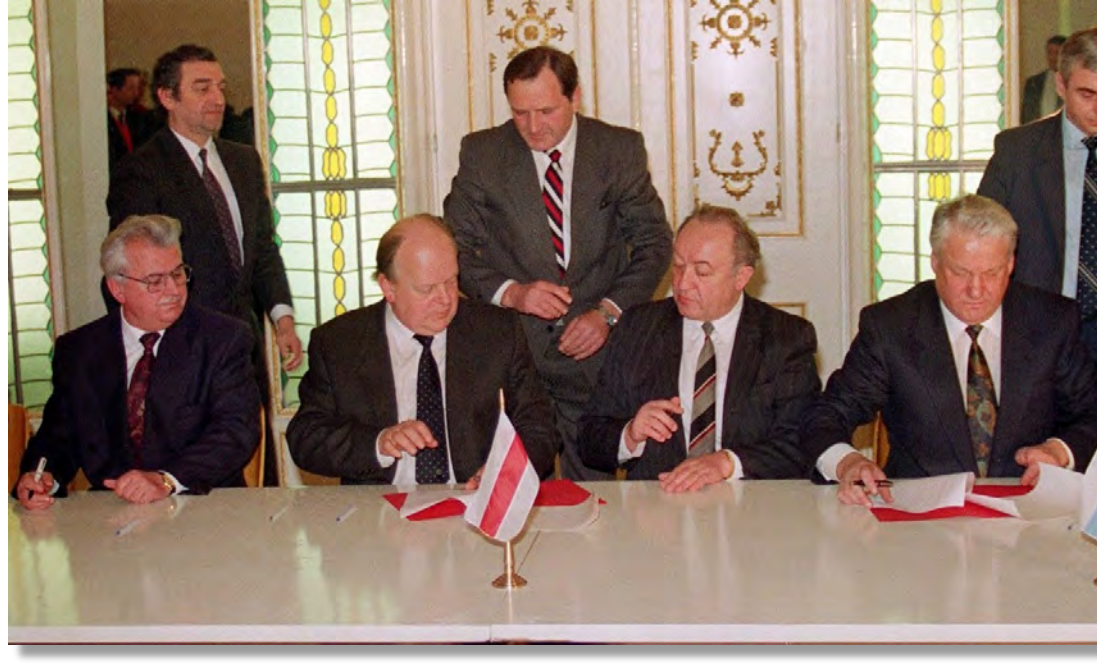
Signing the Belovezh Accord on 8 December 1991