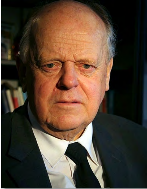
Dr. Stanislav Shushkevich